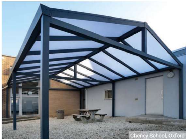
Cheney School, Oxford