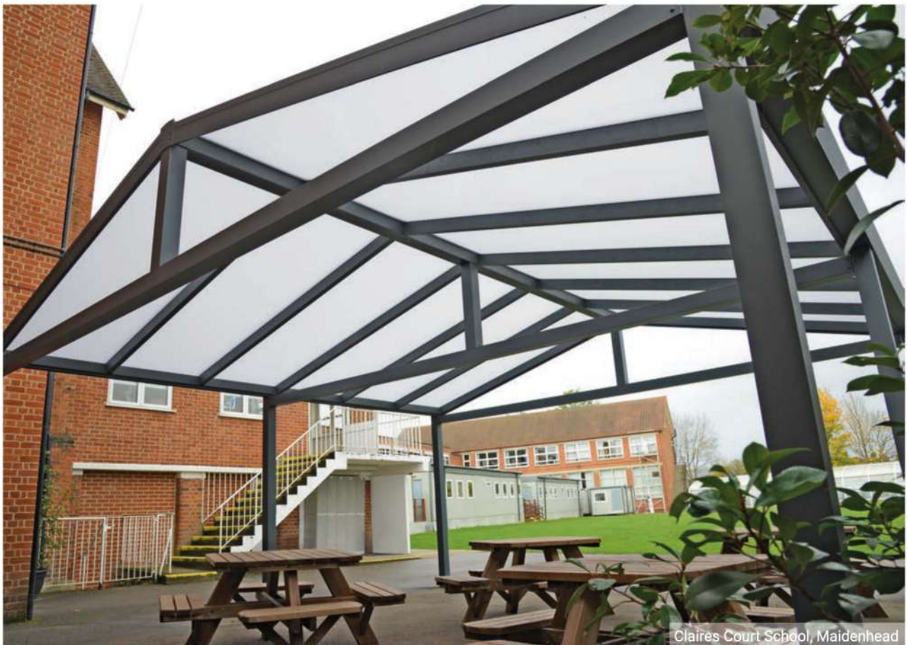
Claires Court School, Maidenhead